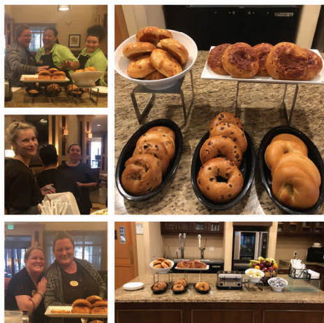
Bagels & donuts for the team in Vancouver