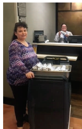
Celebration burritos in La Quinta