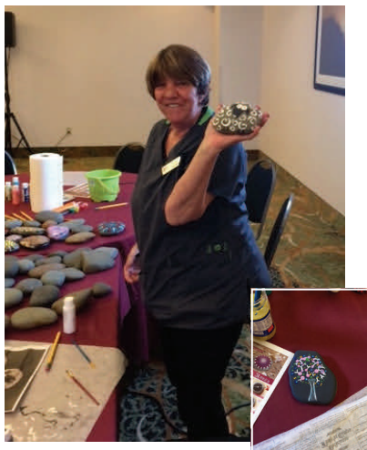
Rock painting in Agate Beach